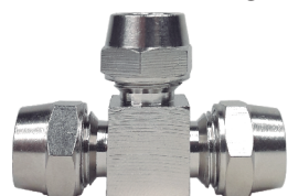
Tubo (Métrico) - Rosca (R)