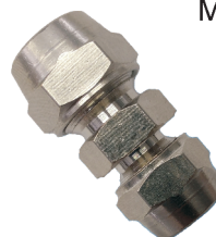
Tubo (Métrico) - Rosca (R)