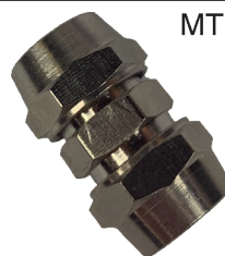
Tubo (Métrico) - Rosca (R)